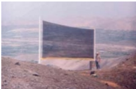
Experimental facility in Lila (Peru).