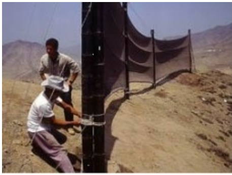
Fog collectors in Peru.