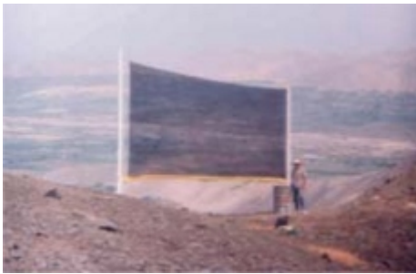
Experimental facility in Lila (Peru).

A brochure from ISIM and OIE " The search for blue gold " mentions the case of mountain villages in Chile where the water in the past had to be carried in tankers, which were moreover used for other purposes due to economic reasons and was sometimes contaminated.