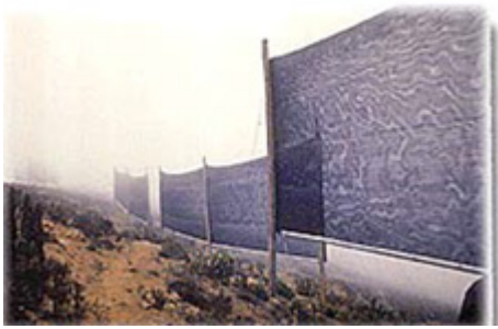
Fog collectors in El Tofo, Chile.

scattered throughout the village was as such formed. After receiving training, the latter are able to intervene according to their availability. Moreover, a stock of tools was formed in order to ensure the availability of all of the tools needed to make repairs. Everything is still operating well.