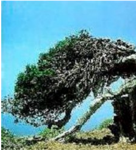
The Gaoré, the fountain tree.